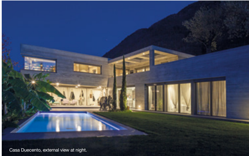
Casa Duecento, external view at night.